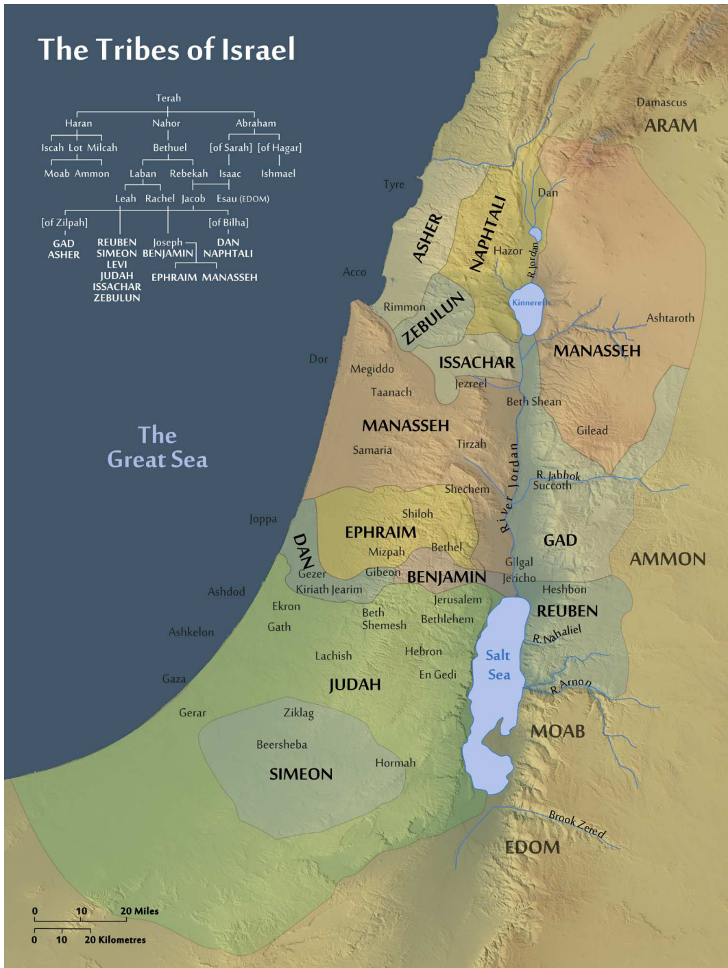
The Tribes Of Israel